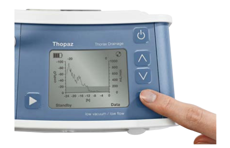
Objective data about the therapy

The simple assembly of the Thopaz tubing and canister, combined with the closed collection of fluids provides staff with an easy to use, hygienic drainage system. The intuitive functionality makes Thopaz simple to operate, and the display of objective, recorded data means clinicians no longer have to estimate the size of air leaks. Together, these features reduce and simplify the work of the clinical personnel.