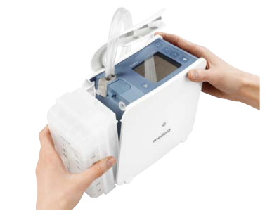
Easy change of canister