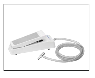
On/off foot switch Cable length of 3.5 m.