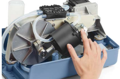
High-quality, durable components