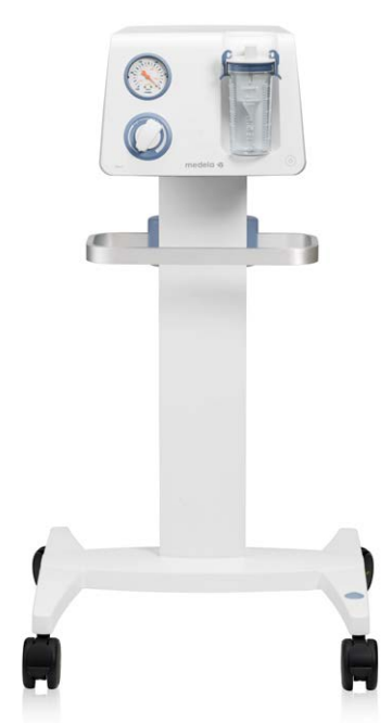
Basic – Surgical Suction Pump